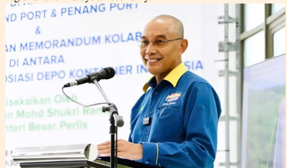
Yang Amat Berhormat Tuan Haji Mohd Shukri Ramli Perlis Chief Minister

YBhg Dato' Shabaruddin Ibrahim emphasized that the agreements with PPSB and ASDEKI demonstrate PIP's long-term commitment to building a sustainable and resilient logistics ecosystem in Malaysia. This includes developing intermodal capabilities and forging strategic partnerships with regional and global logistics players. The MOU with PPSB focuses on integrated rail services and synchronized cargo handling between PIP and Penang, with the goal of repositioning empty containers at both PIP and Penang to serve as a conduit for maritime cargo from the Strait of Melaka and rail freight cargo at PIP. Meanwhile, the MOC with ASDEKI seeks to expand PIP's reach within ASEAN by fostering cross-border cooperation and improving logistics coordination with Indonesia, specifically linking Medan to PIP via Penang Port. ASDEKI's involvement underscores a shared commitment to growth, enabling both countries to leverage their logistics expertise and foster an integrated ASEAN logistics corridor. These partnerships represent a significant development in Northern Malaysia's logistics landscape, driving economic growth and enhancing the movement of goods across borders.